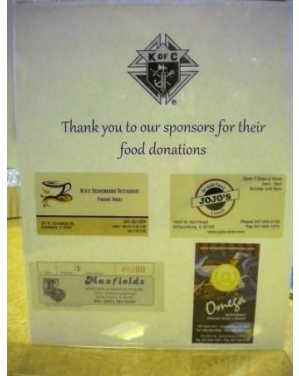
Our Sponsors this Year