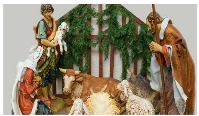
Silent Night Holy Night

<u>Children's Christmas Party</u> – For members' children and grandchildren, 12 and under: Saturday, December 12<sup>th</sup>, 10:00 AM - 4:00 PM in the lower level (basement) of St. Hubert Church.